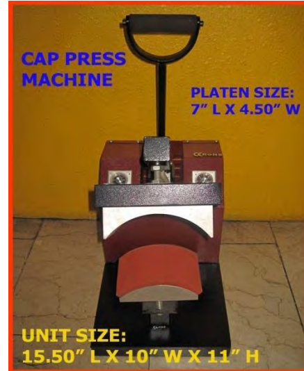
Cap Press Machine