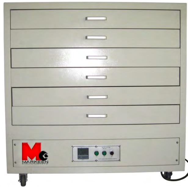
Screen Drying Cabinet