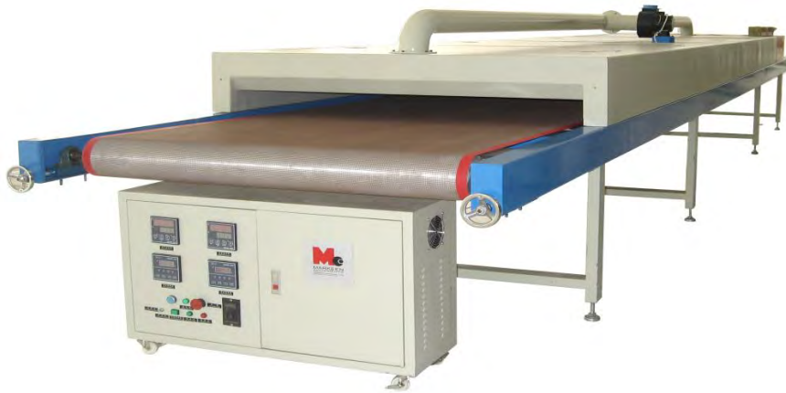
Electric Conveyor Oven