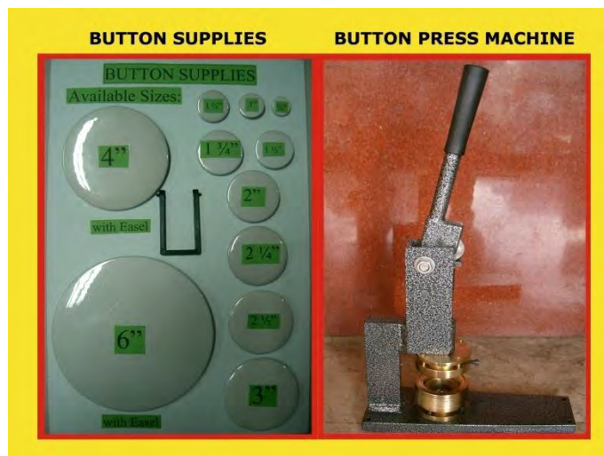
Button Supplies and Machine