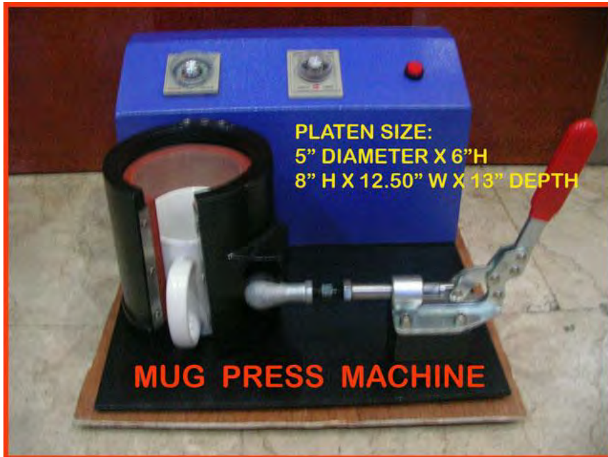
Mug Press Machine