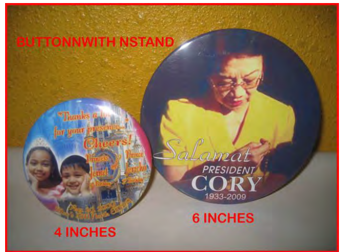
Button Pin Assorted Size Button with stand