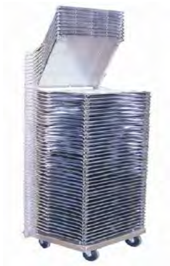
Screen Drying Rack