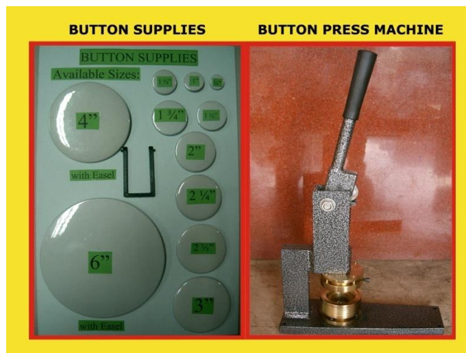
Button Supplies and Machine

QC Main Office: Unit 1 # 1022 E. Rodriguez Sr Avenue, Bgy Mariana QC. Tels 02-7278430; 7229798; 4118083; 4133355 Mobile Nos. : 09228992915; 09173120053; 09175300503 MANILA Branch: Unit 1136 CM Recto Avenue, Bgy 294, Binondo, Manila. Tels 02-2560554; 8713807; Mobile Nos. : 09258992918; 09173256449 Email: printwork88@gmail.com; printwork_88@yahoo.com.ph Visit Our Website: www.printwork.com.ph