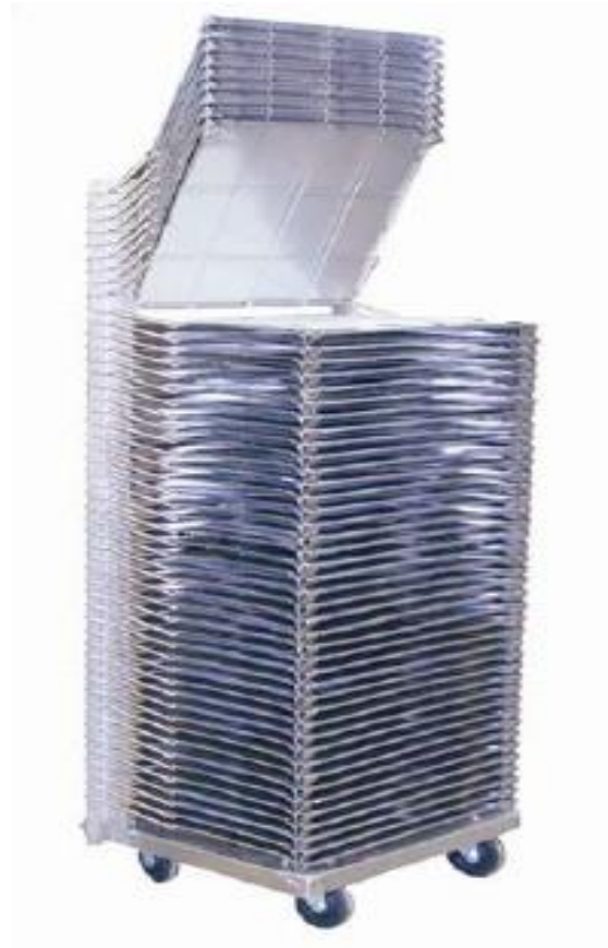
Screen Drying Rack