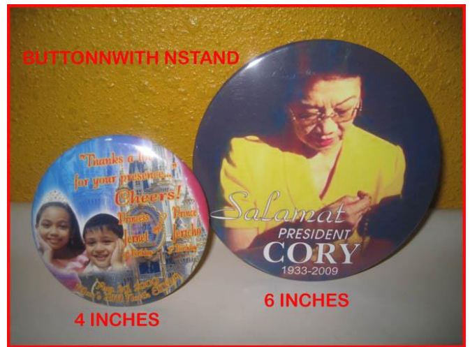
Button Pin Assorted Size Button with stand