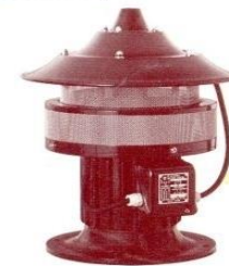
AC-12 type (VERTICAL)

Description: Equipped with reverberation suppressor. 2,000M Audible Radius 800 Watt, 230 Voltage 3,500RPM Weight: 14kg